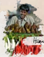
Human well being